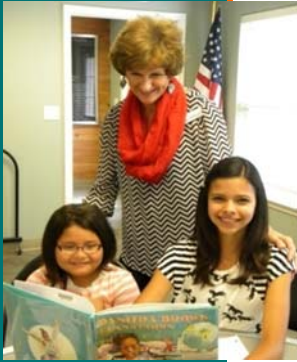
After School Tutoring Sessions produce "smiles of success"!

The Children's Enrichment Program assists with our children's mental, physical and emotional development while building the relationships of the parent, child and family unit. The center is designed to enrich lives of children in the single parent community who may need additional opportunities to enable them to grow, develop and reach their full potential. Parents also have the opportunity to learn and practice the parenting skills that enhance their child's opportunity for development. Skilled staff and caring volunteers offer education support with tutoring and encouragement through training sessions and one-on-one interactive opportunities throughout the week. The outcomes from our Children's Enrichment Program have included brighter futures for countless children through improving their physical, mental and emotional skills, and healthier families for our community with stronger parenting skills and family living skills for now and for the next generation. This program is equipping both young and old to become independent, self-sufficient and productive individuals. Midland Fair Havens is "Building a Future for Families."