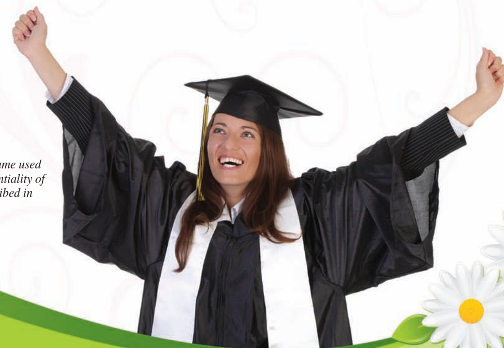
Sarah is a fictitious name used to protect the confidentiality of the actual client described in this story.

Her life has continued on a positive path with a part time nursing job in a drug rehabilitation center while she continues her studies. She has also recently moved into her first house! God has completely turned around her life experience with drug use into a positive ministry so that she can help others with the same problem. Sarah is feeling that her life has real purpose. In keeping with her love for music, she even encouraged a group of her clients to utilize their musical talents to form a band. They recently wrote and dedicated a song to her to demonstrate how much she has meant to them. With the stability and faith of a healthy mother, her three precious daughters are now living in a home where they know that 'anything is possible'!