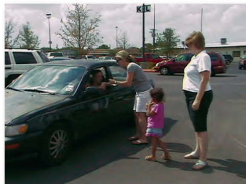
...there were also drive-by donations