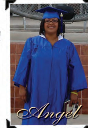
Angel Medical Office Specialist